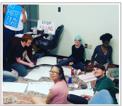
Figure 1: On the opening day of the TPI community space, about 20 – 25 volunteers filled the office working on action planning for a protest of a proposed anti-transgender ordinance. Shown are a few of those making signs for protesters.

FY 2016 marked a very significant turning point for TPI. In January, we operated a kind of "pop-up" office in the front of the Community Pharmacy on Cedar Springs Road once a week. Although drop-in visitation was limited, having a physical space, even if temporary, was well received. When we learned of an inexpensive office space in Oak Cliff, we decided to rent our