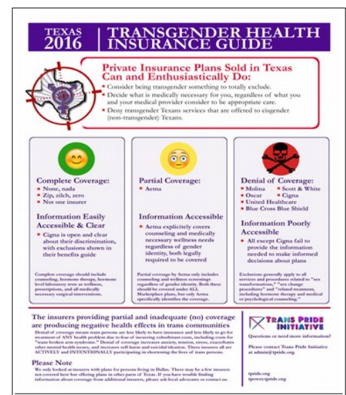
Figure 3: he flier TPI produced for 2016 ACA healthcare marketplace open enrollment for Texas.