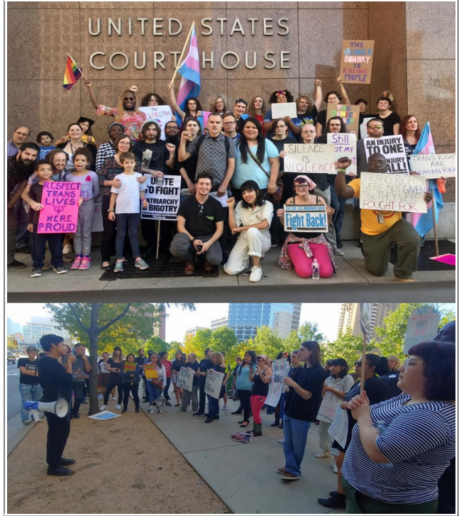
Figure 4: On October 10, 2018, activists demonstrated against the anti-trans bias being fomented by the federal government and other governmental agencies at that time. Such governmental non-support increases violence against trans and gender diverse persons. Demonstrators for environmental justice issues were at the same location, and all mixed together in solidarity with both causes.

In an on-going project, TPI has worked with an anthropology student at the University of